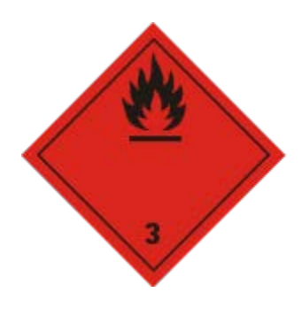
Classes 3 and 4: Flammable liquids and solids