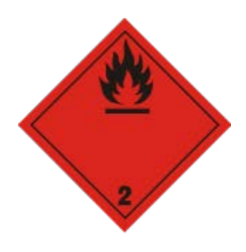
Class 2: Gases