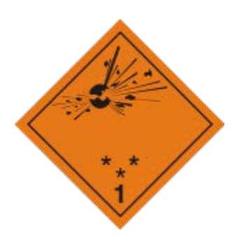
Class 1: Explosives